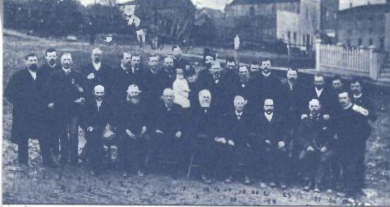
"The Tacoma Twenty Seven"