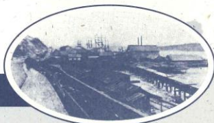
"The Hatch Mill" — Pacific Avenue, Tacoma

Chinese were actively discouraged from settling in Tacoma until the 1920s. What became known as "The Tacoma Method" was frightfully successful and accounts for why our city has no Chinatown today.