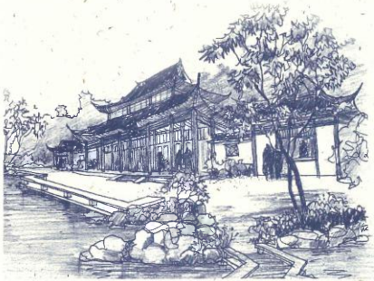
Brochure Published in Tacoma, Washington, October, 2001 Printing Of This Brochure Is Funded By: East Asia Market and Friends